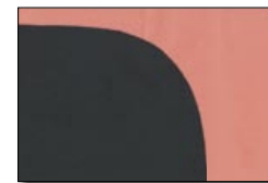
Some of the proposed flags